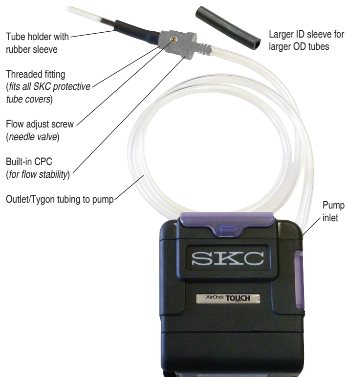
All-in-One Low Flow Adapter/Single Tube Holder with built-in CPC connected to AirChek TOUCH sample pump